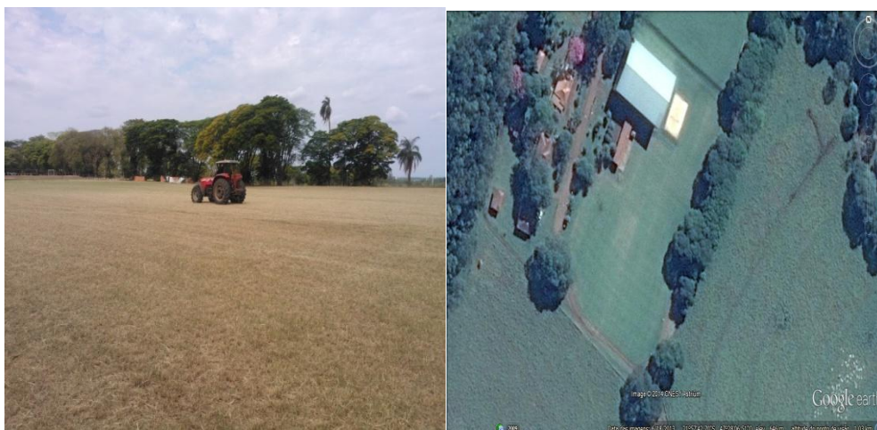
Fig1. Area used to collect the data.

After the data collection in both tractors, the results were put in the Surfer software, used to manipulate the data and generate a map of noise spatial distribution emitted by the tractors.