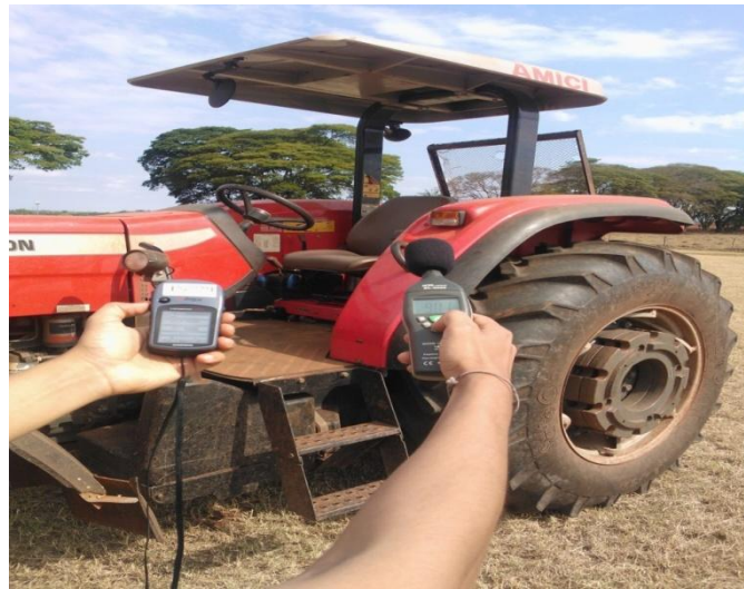
Fig2. Method used to collect data